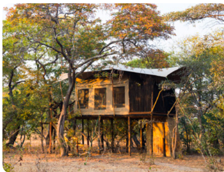
Fig Tree Bush Camp

This camp lies in an undiscovered part of the park on a Shishamba River lagoon. The only camp in a range of 30 km - it offers a unique out-of-Africa atmosphere.